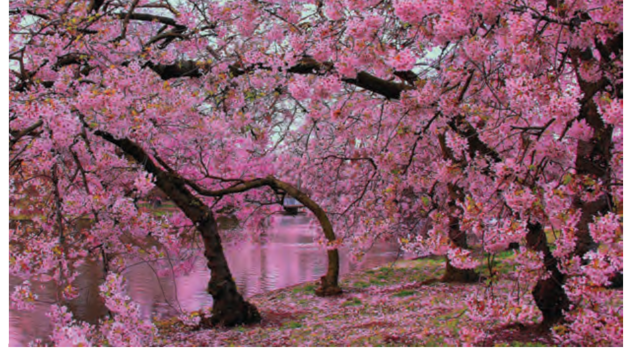
Springtime at St. James's Park, London

There it was: two contrasting worldviews summed up in three words. One supports an economy in which money is the purpose and life is the means. The other supports an economy in which life is the purpose and money is a means. The insights from these two encounters highlight the significance of our framing stories, especially our deepest beliefs about the nature of reality.